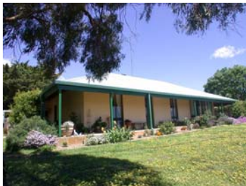
UNDER OFFER Millpost Lane