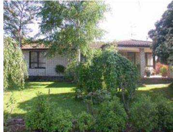
UNDER OFFER Bungendore Road