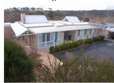
UNDER OFFER Molonglo River Place