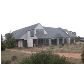
SOLD Norton Road