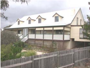
SOLD Shinglehill Way