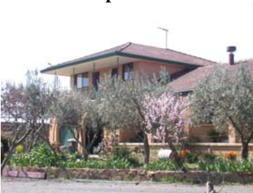
UNDER OFFER Gallagher Crescent