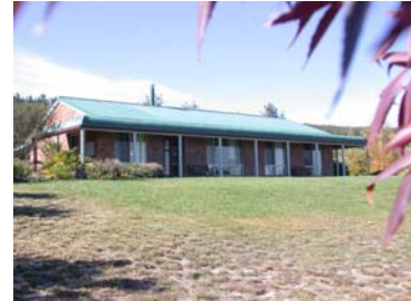
UNDER OFFER Bungendore