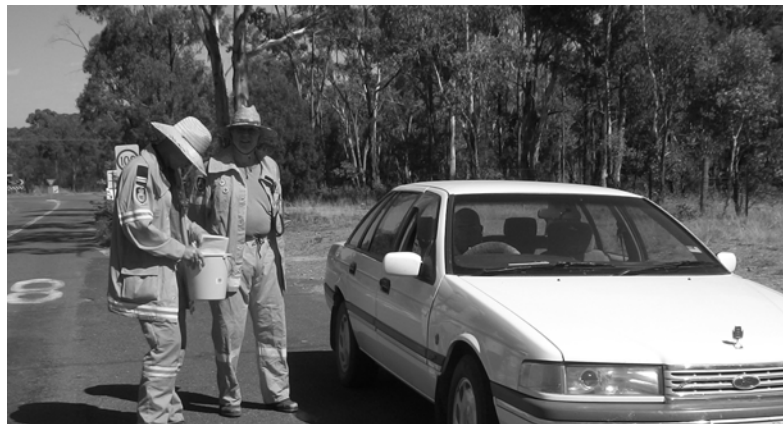
I still seeing some people

using on ride-on mowers late in the day when the humidity is low and the temperature is up. This is still risky and I can only hope that part of the message from last month is being heeded and adequate water is being carried to douse any fires started by sparks or the friction from rotating shafts on dry grass.