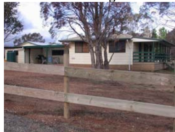
UNDER OFFER Woolcara Lane