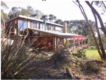
UNDER OFFER Forest Road