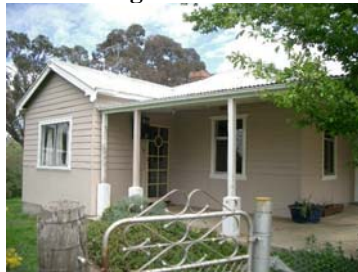
UNDER OFFER Gunning