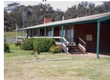
UNDER OFFER Sugarloaf Ridge Road